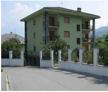
Our new apartment is on the ground floor

And since we found it directly (without using an agency) we saved almost $1,000 in agency fees. This apartment, combined with some “last minute” new supporters, means that we should now have enough support to at least “get by” for our second term. We are trusting the Lord to provide for any gaps – just as He did for our first term.