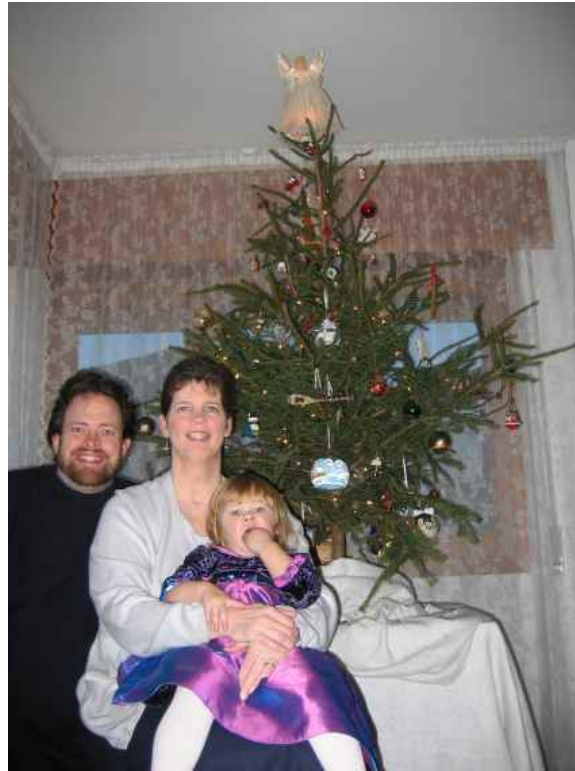
Hope your Christmas was wonderful!